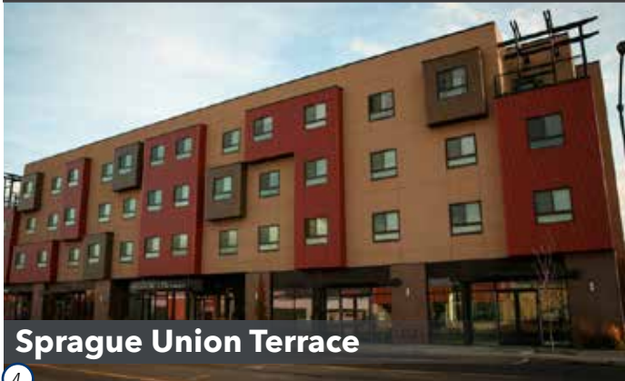
Sprague Union Terrace