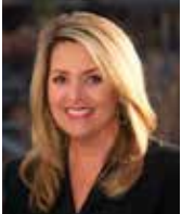
Mayor Nadine Woodward Executive Team City of Spokane