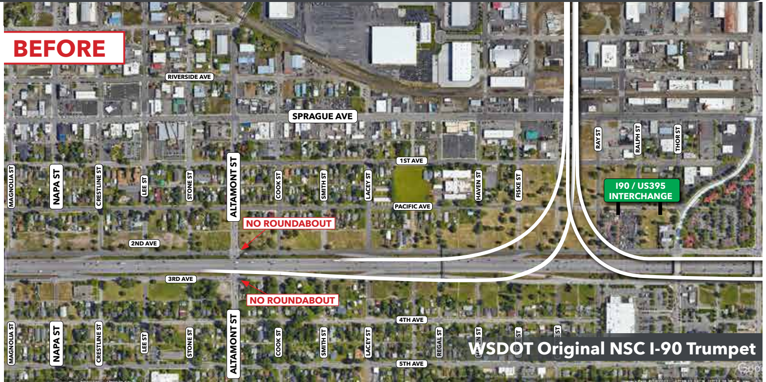
WSDOT Original NSC I-90 Trumpet

Thanks to ESBA's efforts, the latest Washington Department of Transportation (WSDOT) plan now features Altamont Street roundabouts that will help improve traffic flow and reduce accidents, while at the same time gained access to the North Spokane Corridor (NSC) provides a direct connection to the East Central neighborhood from and to the NSC.