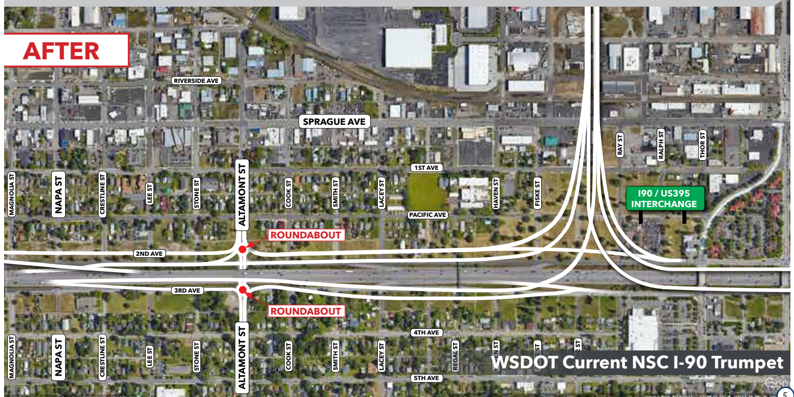
WSDOT Current NSC I-90 Trumpet