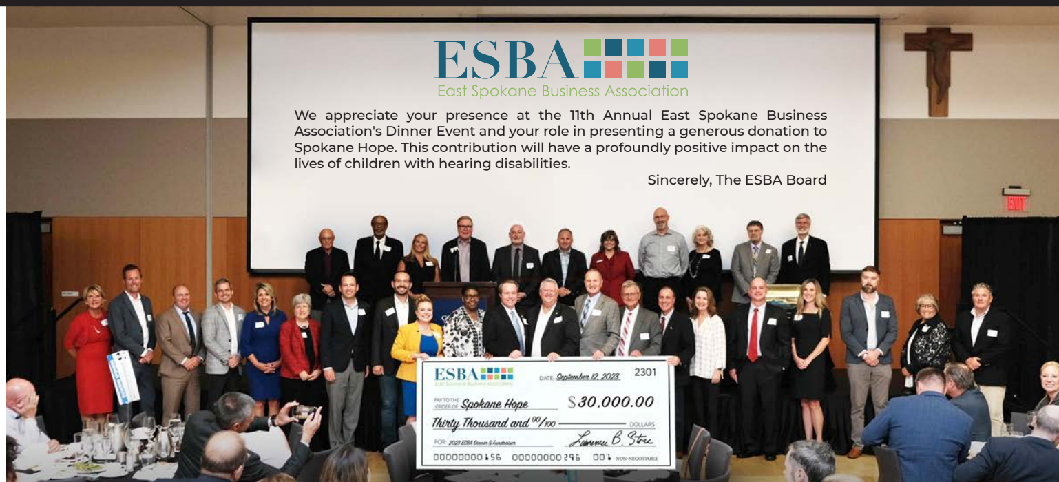
United in Purpose: Dignitaries and sponsors take center stage, proudly showcasing the $30,000 donation check for Spokane Hope at the East Spokane Business Association's Annual Dinner Event.

ESBA Mission: At the East Spokane Business Association, our mission is clear: To support the East Spokane Business District by preserving and improving its unique facilities, infrastructure, and commercial interests.