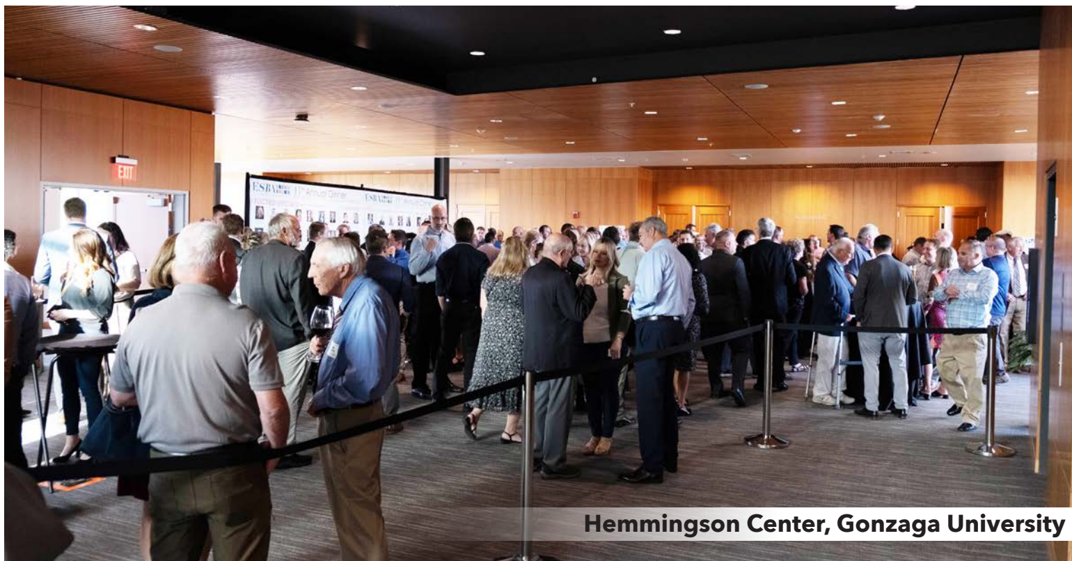
Hemmingson Center, Gonzaga University

ESBA Event last September, showcasing the vibrant mingling of over 300 attendees, including dignitaries, elected officials, local business representatives, and esteemed community leaders.