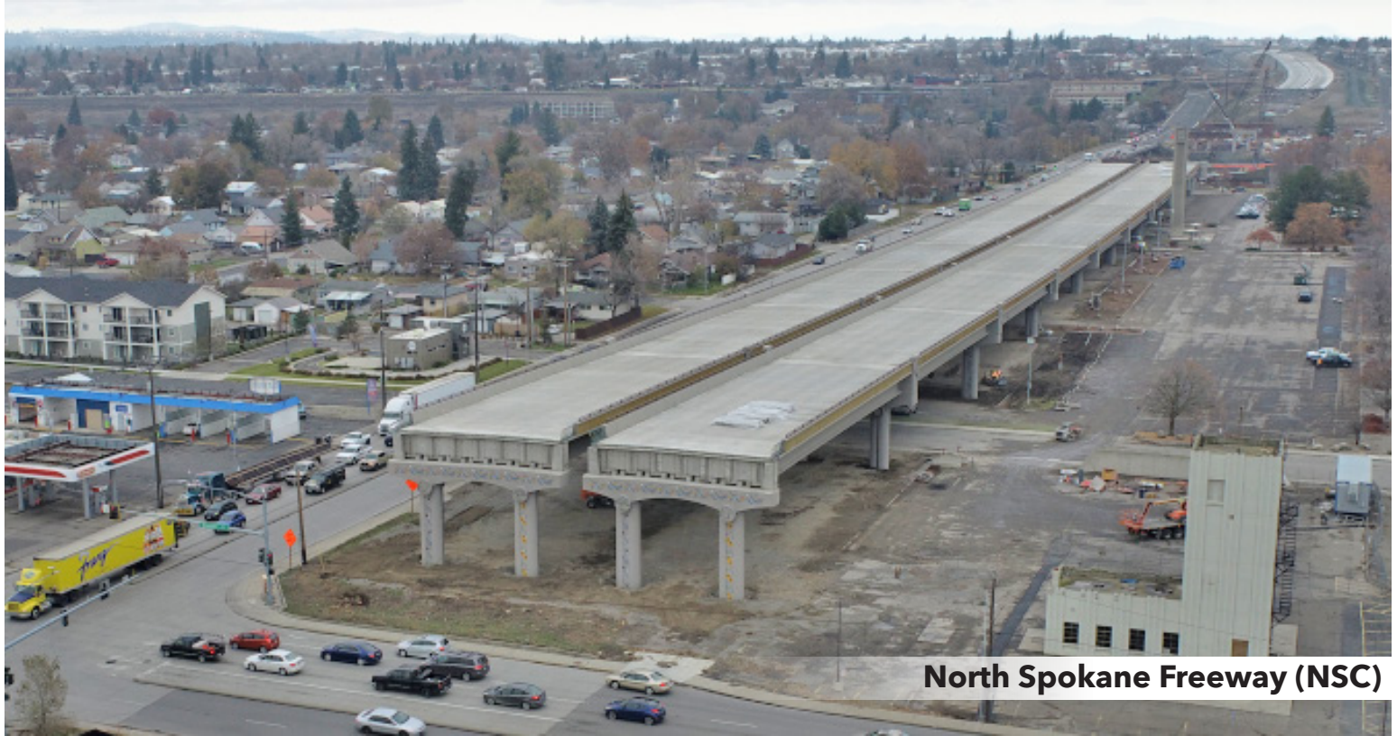
North Spokane Freeway (NSC)

Advancing Connectivity and Economic Growth with the North Spokane Freeway's Significant Milestones